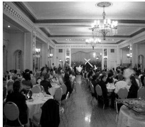
Prom Night – Arlington Hotel

Glamour, glitz and good times! ASMSA students enjoyed a terrific evening on Friday, April 20th. The evening began with an informal gathering for pictures in the main lobby of the RLO. Due to rain, the students were transported to the Arlington.